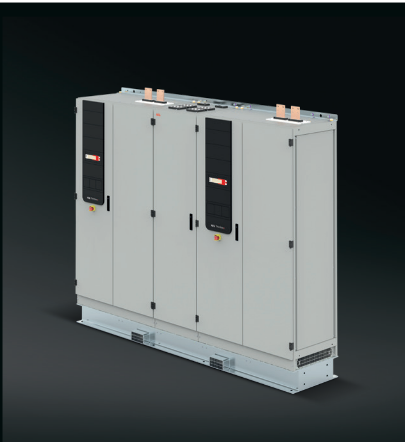
Two Thyrobox dc 3 on baseframe with paralleling cabinet, options: DC top, water bottom, AC top