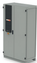
1,25 MW Rectifier Module