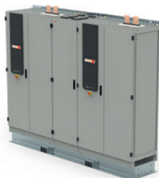
2,5 MW Power Frame