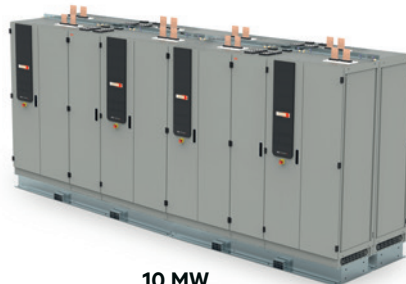
10 MW Power Block

To increase power density and to allow easier installation on site, a new base frame solution for two Thyrobox dc 3 systems is proposed by AEG Power Solutions.