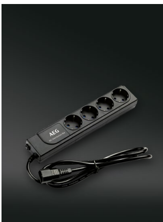
IEC Distribution Bar