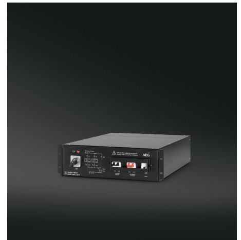
Power Distribution Box